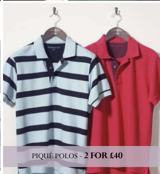
PIQUÉ POLOS - 2 FOR £40