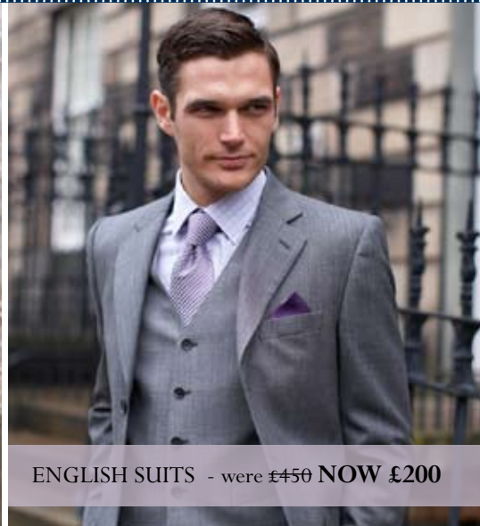
ENGLISH SUITS - were £450 NOW £200