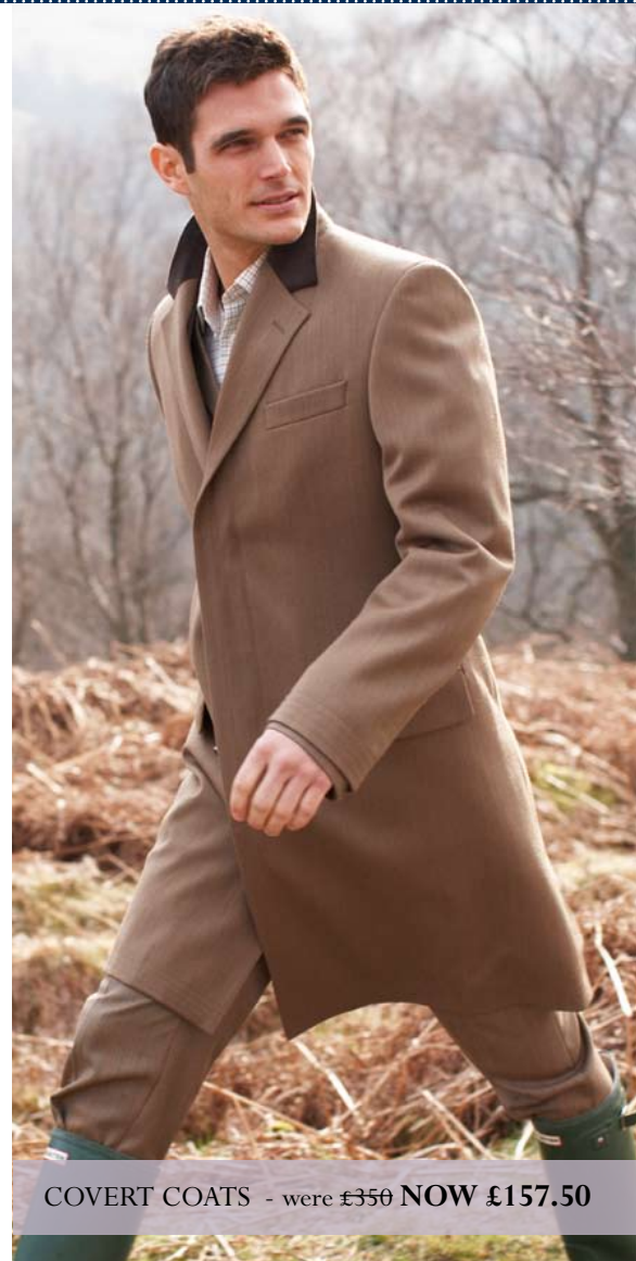
COVERT COATS - were £350 NOW £157.50