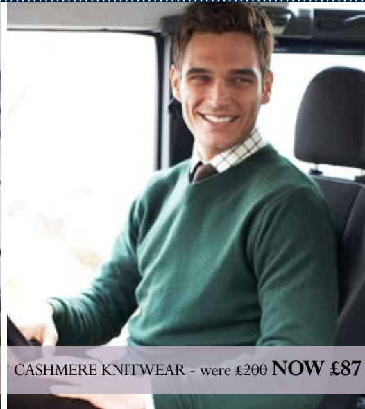
CASHMERE KNITWEAR - were £200 NOW £87